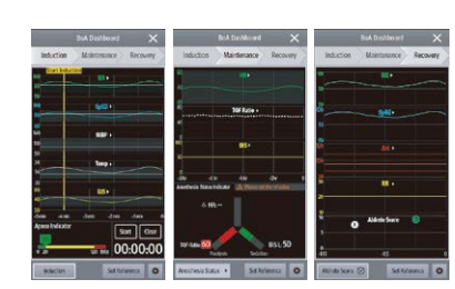
BoA Dashboard ™

Provides a checklist to help clinicians screen, diagnose and treat septic patients according to the SSC guidelines.