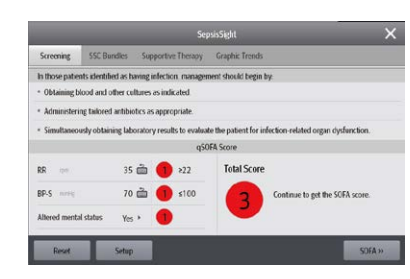
Sepsis Sight \ ^{TM}

Helps clinicians make decisions through sets of haemodynamic assistive applications.